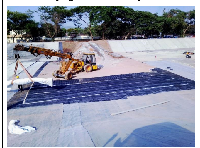
Laying of Geotextile layers

Towards Engineering Excellence Geotextile layers